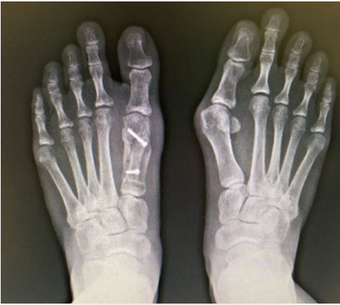
手術後（左腳）；手術前（右腳） After surgery (left foot); before surgery (right foot)